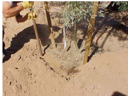
Figure 16. Continue compacting the backfill until you reach the finished grade.