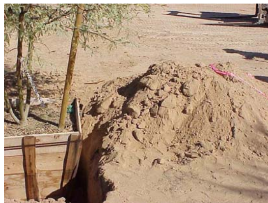
Figure 6. Back fill with the soil removed from the hole to create a good interface between the rootball and the surrounding undisturbed soil.