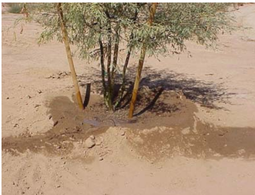
Figure 18. Deep irrigations allow surface applied fertilizer to penetrate into the rootball.

vulnerable to freeze injury in winter. Read and follow the recommended application rates and re-application intervals listed on the package for the specific fertilizer product used.