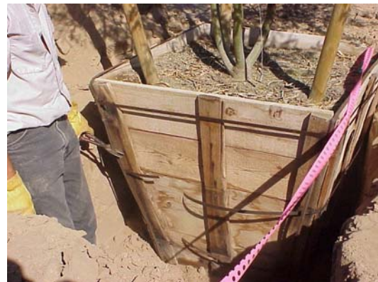
Figure 10. It is not necessary to remove the bottom of the box.