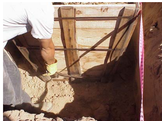
Figure 7B. Cut bottom band first.