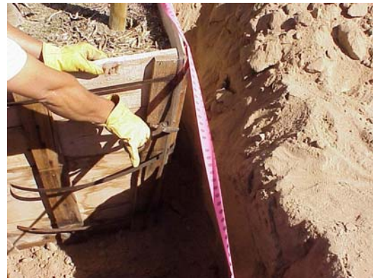
Figure 9. Cut vertical bands next.

Applying fertilizer formulations that contain nitrogen and phosphorous immediately following transplanting, in either granular or liquid form, promotes rapid vegetative growth and contributes to new root development (Figure 21). In nutrient poor soils it may be desirable to use a formulation adding potassium (Potash) and micronutrients. When using dry fertilizers the best results are with homogeneous formulations. In these formulations each granule of product has the same nutrient concentration (e.g. 20% N, 20% P and 20% K). Blended NPK fertilizers (e.g. 20-20-20) are separate nitrogen, phosphorous and potassium granules mixed together. To provide nutrients