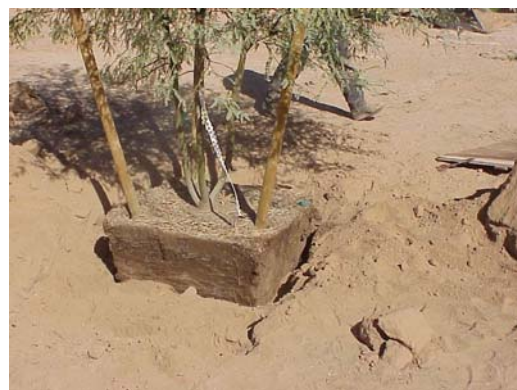
Figure 14. When all 4 are removed, complete backfilling the hole.