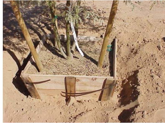
Figure 12. Remove strap.

Periodic light thinning is the most desirable method of pruning for recently transplanted trees. Light thinning, especially important in June, July and August can reduce the number of wind-damaged branches and prevent uprooting of trees. Removing large portions of the tree canopy (more than 30%) during any one pruning session in the summer growing season, can lead to aggressive, unwanted regrowth, limited root development and increased vulnerability to sunburn injuries that can be colonized by wood boring insects. No more than 20% of the tree foliage should be removed at any one time with 80% of this pruning concentrated on the new growth on the outer third of the canopy. Limbs pruned from these areas should be no larger than about 1/2 inch in diameter and should require only hand pruners to remove. The remaining 20% should be pruned from the inner two thirds of the canopy removing succulent ("water") growth and crossing branches. Crossing branches or succulent growth should be removed from this inner 20% periodically throughout the growing season as some of these "temporary" branches serve to help permanent branches develop caliper, taper and greater strength.