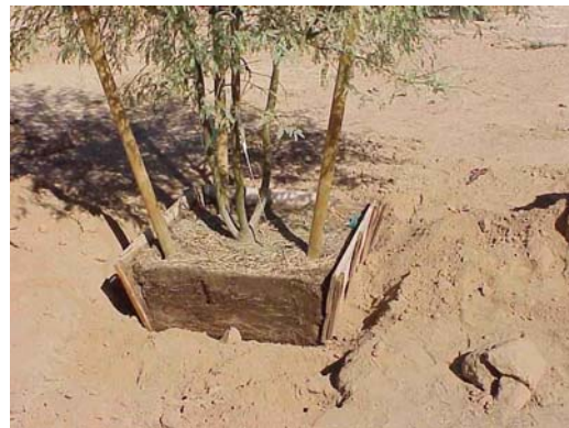
Figure 13. Remove box sides, one at a time.