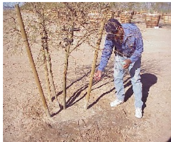
Figure 21. To provide nutrients for both existing and developing roots distribute fertilizer uniformly beneath the leaf canopy from the trunk to just beyond the drip line. Irrigate generously following application to allow fertilizer to penetrate into the root zone.