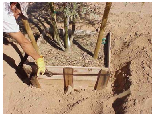
Figure 11. Cut the top most band last.