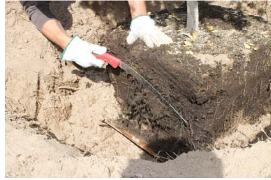
Figure 7A. For well rooted container grown trees and prior years field dug trees prune away 1/4 to 3/4" of the outer edge of the rootball removing any matted, kinked and circling roots.

The frequency of tree irrigation will depend on soil type and texture, maturity of the tree, and the time of year (day and night temperatures). Sandy, more porous soils will require more frequent application of water than will loamy and clay bearing soils. Similarly, the duration of the irrigation will depend upon the number of emitters and the volume of water per hour they deliver, the growth stage of the tree and the time of year. Immediately following transplantation trees have the same root mass they had when in the container and should be irrigated as if they were still containerized. During this transition, irrigation schedules should be appropriate to the season and the limited distribution of the roots. Depending on the time of year it may take several weeks or even months before the roots of transplanted trees explore beyond the original growing container. Post installation irrigation must take into account the soil type and drainage characteristics, day and night temperatures, relative humidity, other potential sources of water (lawn irrigation, rain gutters, general site drainage and other sources) and the differing tolerance of desert tree species to saturated soils. Trees irrigated using a