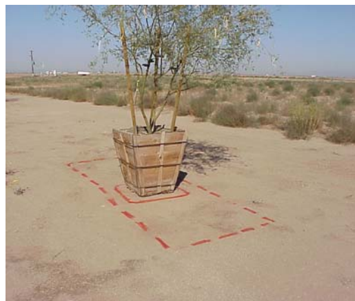
Figure 1. Select tree with a form and shape that compliments all the use of the landscape and does not adversely impact surrounding plant material, turf, pedestrians, signage, or hardscape elements. Solid line indicates planting hole, broken line indicates area of fractured soil.

Dedicated to providing quality trees to the landscape industry, that are appropriate to the desert Southwest