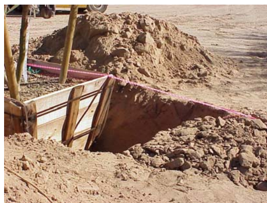
Figure 2. It is not necessary to remove the bottom of the box. The bottom of the box should sit on undisturbed soil and the crown of the tree should be about 5 to 10% above the finished grade.