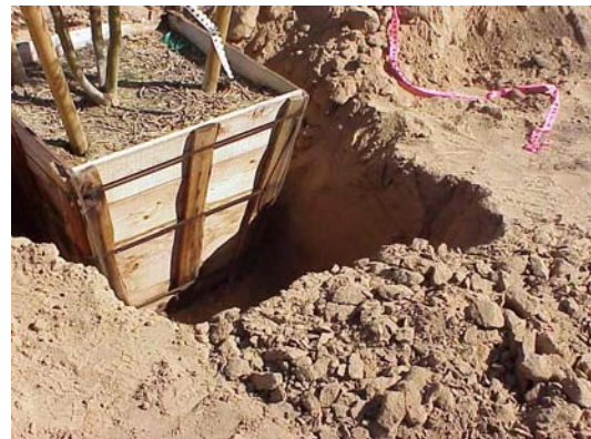
Figure 5. Fractured soil improves water pene-