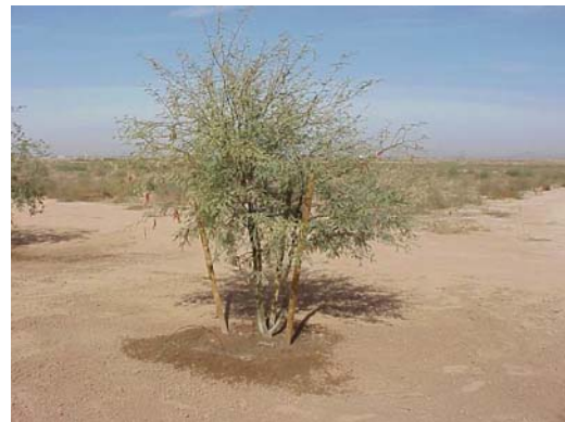
Figure 19. Grade down temporary tree well exposing root-ball 1-2 inches above grade for top dressing with mulch/decomposed gravel.