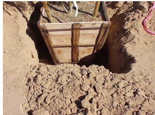
Figure 4. Where it is not cost effective to dig a wider planting hole, fracture soil to promote root development.