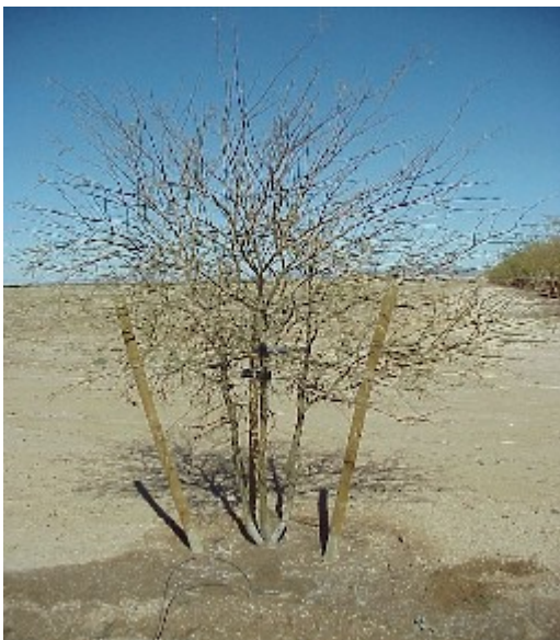
Figure 20. Ties connect the tree trunk to the stakes and are typically arranged opposite one another to provide support yet allow give. Ties are padded where they contact the tree's bark to prevent injury and damage.