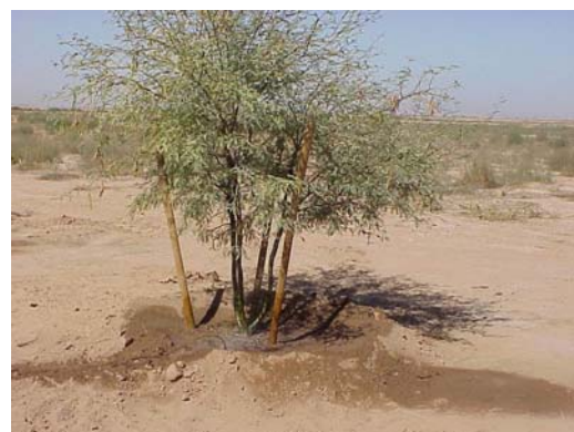
Figure 17. Set-up a temporary tree well for the initial 1st and 2nd deep irrigations to help further settle the back fill.