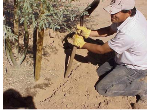
Figure 15. Using the shovel handle, periodically tamp the backfill to remove air pockets.

The majority of arid landscape trees have evolved in, and are well adapted to, nutrient poor soils. The lack of rainfall and the limited availability of nutrients serve to moderate the growth of trees in the native Sonoran desert and likely explains why wind throw is rarely or ever seen in undisturbed desert settings. Water and fertilizer are effective tools for managing tree growth and overall health of desert trees in landscapes. When trees approach or reach the desired size, reducing or eliminating the application of nitrogen and irrigation will slow or moderate growth. Slower growth of maturing trees limits the severity of branch damage from summer wind storms, reduces the risk of wind throw, and limits the amount of annual pruning required. Late summer and early fall applications of nitrogen can encourage late season vegetative growth that is more