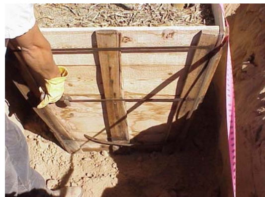
Figure 8. Cut the middle band second.