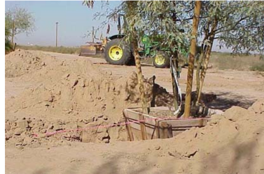
Figure 3. Leaving tree slightly above grade insures that if rootball settles that crown will remain at or above grade.

Chemical fertilizers should be applied to the surface of the soil and "watered-in." A temporary tree well will help contain post installation irrigations allowing soil to settle and fill any remaining air pockets in the backfill (Figure 18 and 19).