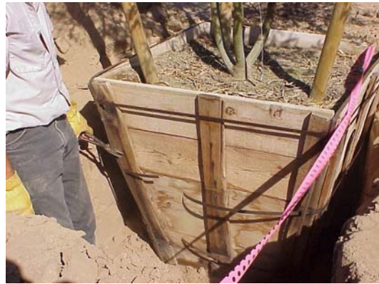
Figure 10. It is not necessary to remove the bottom of the box.