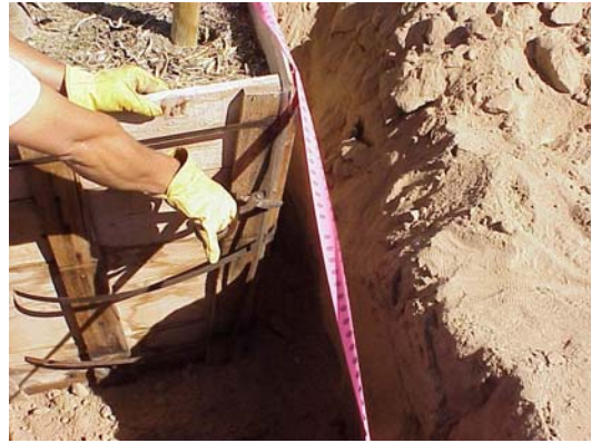
Figure 9. Cut vertical bands next.

Applying fertilizer formulations that contain nitrogen and phosphorous immediately following transplanting, in either granular or liquid form, promotes rapid vegetative growth and contributes to new root development (Figure 21). In nutrient poor soils it may be desirable to use a formulation adding potassium (Potash) and micronutrients. When using dry fertilizers the best results are with homogeneous formulations. In these formulations each granule of product has the same nutrient concentration (e.g. 20% N, 20% P and 20% K). Blended NPK fertilizers (e.g. 20-20-20) are separate nitrogen, phosphorous and potassium granules mixed together. To provide nutrients