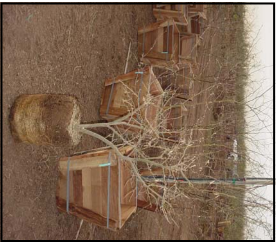
No Root Management Program. With the dense circling mesh of roots, this can be a problem tree in the future.

Which tree would you plant? One with circling roots and potential future problems, or a tree grown under the AZT™ Root Management Program which greatly reduces the possibility of circling roots!