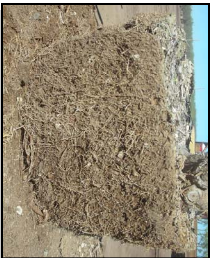
AZT™ Root Management Program After Root Pruning. Root pruning is one more step to reduce the possibility of circling roots and to encourage radiant root growth in the next container size.