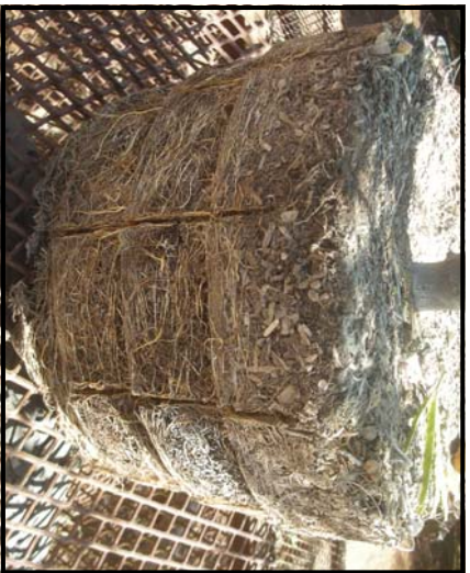
AZT™ Root Management Program Before Root Pruning. Tree rootball pulled out of the air root pruning container. Notice the vertical and horizontal grooves from the ridged container and network of non-circling feeder roots from air root pruning.